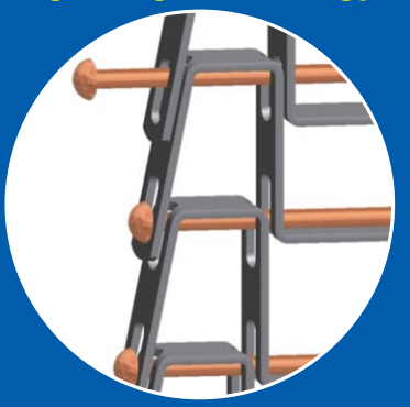
No catch points! No hook or sharp edges!