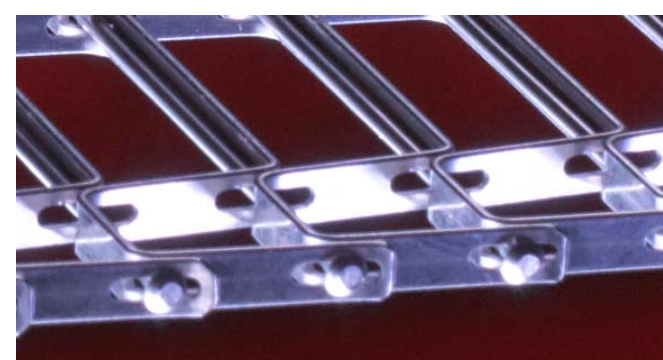
Forged Edge Technology<sup>™</sup> - Creates an edge with no catch points, hook or sharp edges!